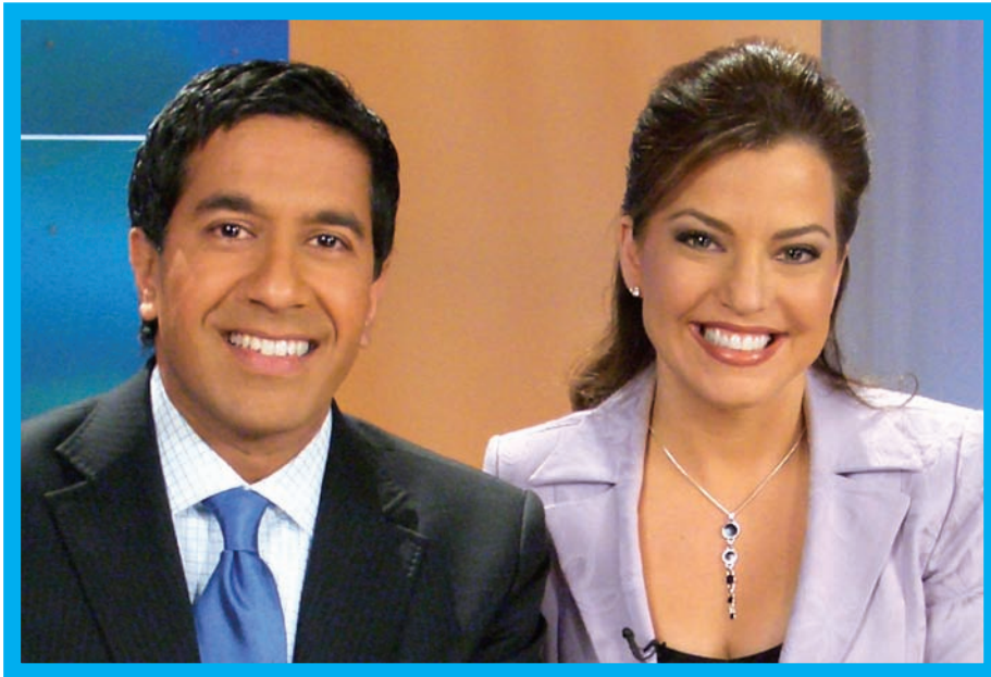
AccentHealth co-hosts Dr. Sanjay Gupta and Robin Meade